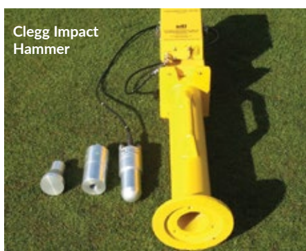
Clegg Impact Hammer