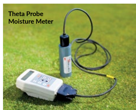
Theta Probe Moisture Meter

The results are compared against target performance levels and across the golf course for consistency. These measurements are analysed and interpreted by our sportsturf agronomists, in partnership with the superintendent, to provide valuable input into the management of your greens.